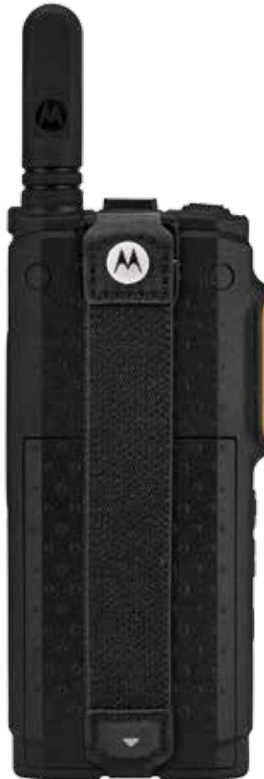
PMLN7076 Flexible Hand Strap