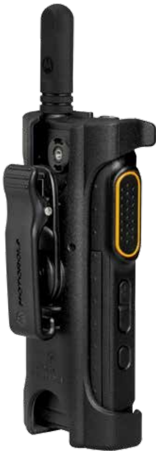
PMLN7190 Carry Holder/Holster with Swivel Belt Clip

By spending countless hours in the field with customers, we've developed accessories that aren't just the most innovative. But also the most useful.